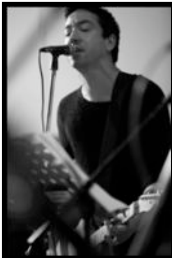
Jon Toogood - Shihad