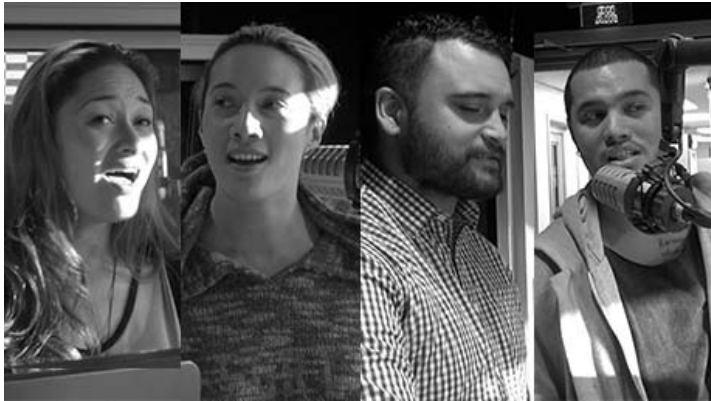
Maisey Rika, Ria Hall, Troy Kingi and Stan Walker. (left to right)

Match the word in Te Reo with the word in English: